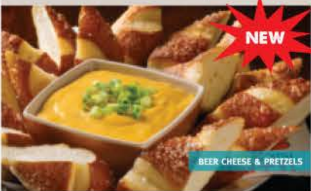
BEER CHEESE & PRETZELS