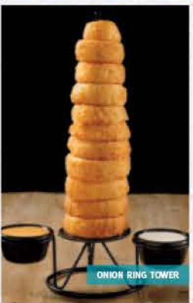
ONION RING TOWER