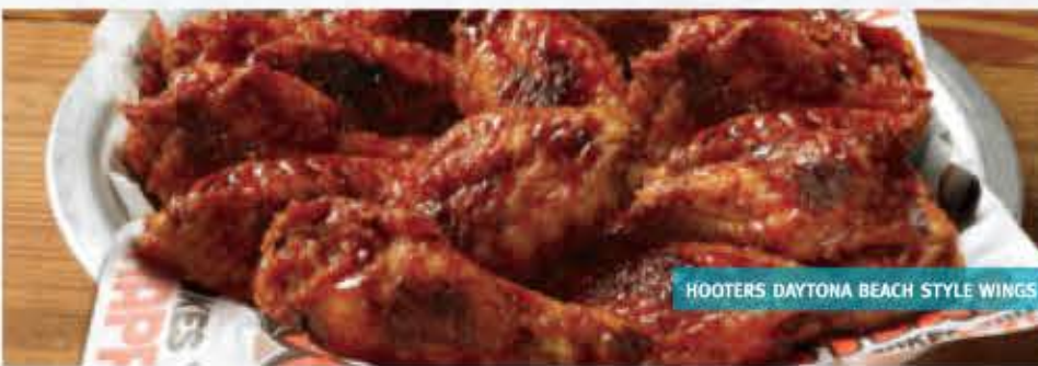
HOOTERS DAYTONA BEACH STYLE WINGS

NAKED WINGS 6 PCS = 7.29 | 10 PCS = 10.49 | 20 PCS = 17.79 | 50 PCS = 45.99 Traditional style. No breading, but just as good. Order them with your favorite Hooters wing sauce.