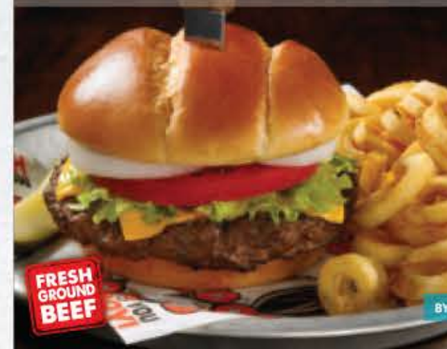
FRESH GROUND BEEF

ALL BURGERS ARE SERVED WITH A SIDE OF CURLY FRIES. SUBSTITUTE FRIES WITH TATER TOTS, ONION RINGS OR A SIDE SALAD +.99