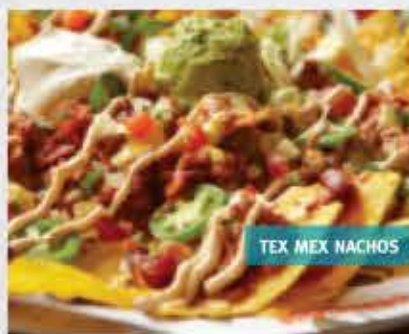
TEX MEX NACHOS