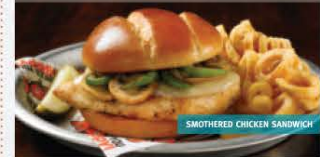
SMOTHERED CHICKEN SANDWICH

ALL SANDWICHES ARE SERVED WITH A SIDE OF CURLY FRIES. SUBSTITUTE FRIES WITH TATER TOTS, ONION RINGS OR A SIDE SALAD +.99