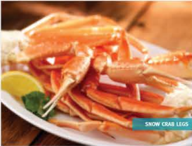
SNOW CRAB LEGS

SNOW CRAB LEGS Deadliest Catch™ approved! But seriously, you are about to bite into crab legs that are shipped to us from the frosty banks of Alaska and served up right with a side of butter. Makes you feel kinda fancy, doesn't it? MARKET PRICE