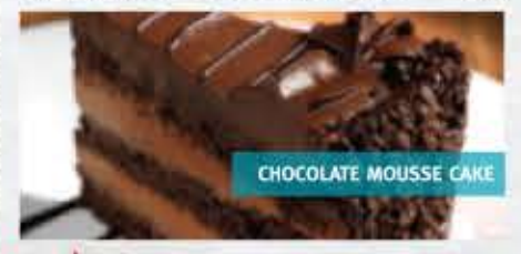
CHOCOLATE MOUSSE CAKE

CHOOSE FROM THREE DELICIOUS CLASSICS OR ONE OF OUR NEW DESSERT SHOOTERS 2.99 EACH CHOCOLATE MOUSSE CAKE 4.99 KEY LIME PIE 4.99 CARAMEL FUDGE CHEESECAKE 4.99