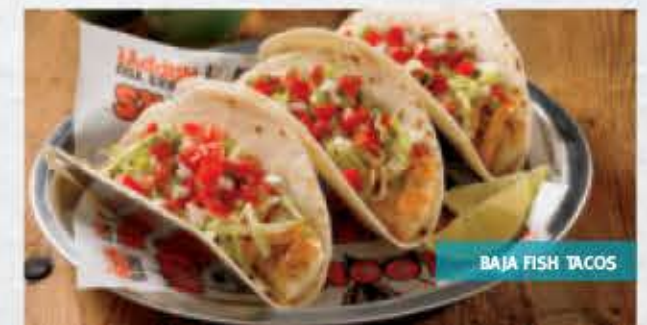
BAJA FISH TACOS

HOOTERS ORIGINAL BUFFALO CHICKEN TACOS 10.29 Is there anything Buffalo chicken can't do? Grilled or crispy chicken tossed in your favorite wing sauce, topped with cabbage, pico de gallo and your choice of ranch or bleu cheese inside flour tortillas.